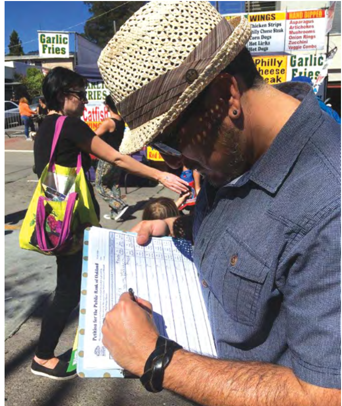
Friends of the Public Bank of Oakland

City residents have also sought to establish public banks in their municipalities. In 2016, the Friends of the Public Bank of Oakland was formed. A Friends of the Public Bank of Oakland white paper demonstrates their strategy for identifying funds as well as the initial scale of the proposed bank: "Oakland can use liquid assets it owns as part of the capitalization base required to create the bank. Other funds necessary to get the bank up and running will come from the General Fund or a small bond levy, ultimately repaid many times over as Oakland prospers. A total of some $20 million to $30 million in capitalization will be required." 155 As a result of their pressure, the Oakland City Council committed to producing a feasibility study for a public bank.