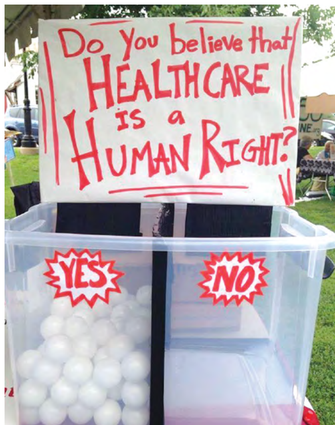
Southern Maine Workers' Center

Many of these programs play a vital role in people’s lives, but taken together, they are a jumbled, fragmented mess. The patchwork nature of our social support system leads to several problems: