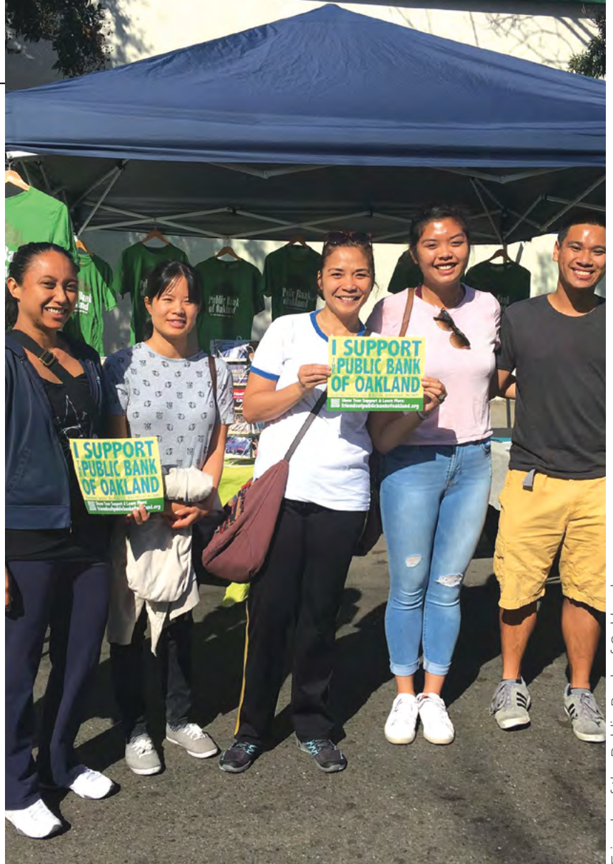
Friends of the Public Bank of Oakland

The flow of capital in an economy should serve social goals. Although there has always been misalignment between capital and social needs, historically most investments at least created goods or services of some kind. In the wake of financial liberalization, a huge portion of capital is now moved largely for the purpose of making more money in ways that, at best, add no value, and, at worst, directly harm families, communities, and our environment. The concentration and misuse of capital require a serious reimagining of how we, as a country and a world, ensure that both private and public financing mechanisms lead to equitable investment in the common good.